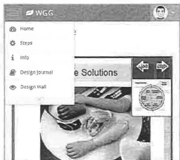
Figure 1: WISEngineering Tablet Portal. It delivers step by step instructions of an engineering project (e.g., creating a prosthetic leg for disabled people). Tools such as a design journal and design wall allow reflection and discussion. Distributed clusters at backend serve large volume of video and picture uploads from students.

For example, Yang et al. studied the learning data of Scratch [6], an informal learning platform for computer programming. In this study, learning processes are modeled as the cumulative trajectory of the programming blocks mastered by learners [10].